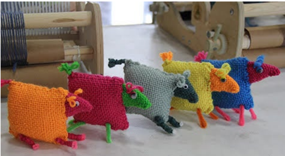
Handwoven sheep on display at our 2018 Sheep to Shawl.

I look forward to seeing everyone at Sheep to Shawl on the 28th and sharing this special art form with our community.